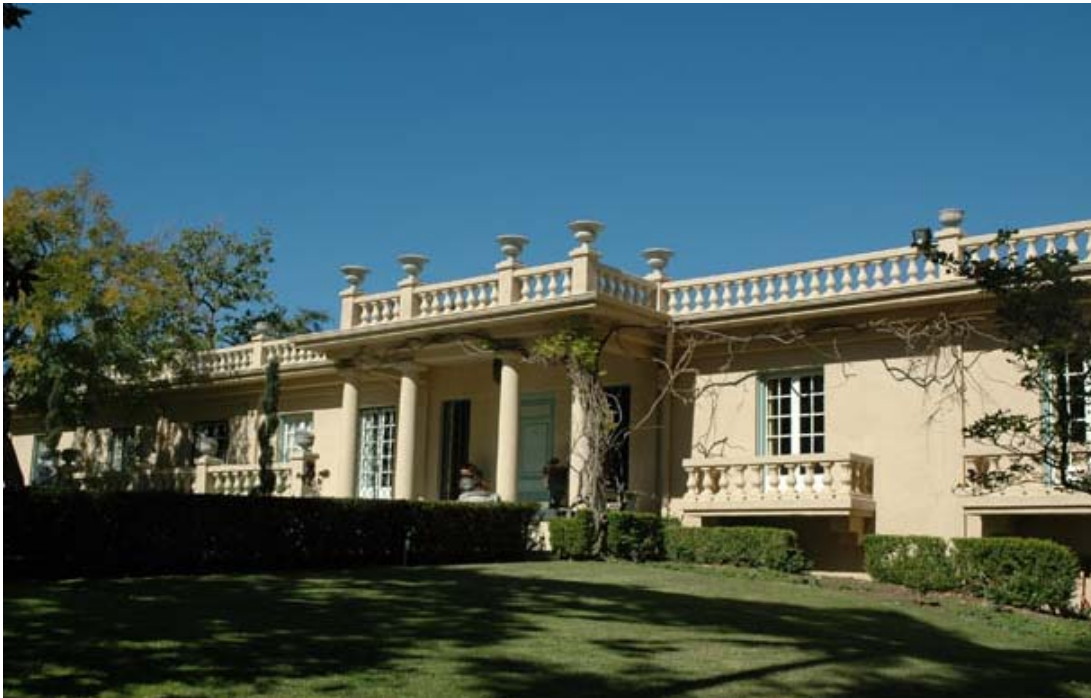
Figure 1, Source: KSM Architecture

Pursuant to the City of Beverly Hills Historic Preservation Ordinance (Title 10, Chapter 3, Article 32; BHMC 10-3-32), this property meets the necessary requirements for local landmark designation. The Robinson Estate and Garden is eligible under “significance” criterion A.1, as it was the first grand estate with gardens built in Beverly Hills and, therefore, manifests tangible features and contributions to the very early residential development and architectural history of the City. The property also meets “significant” criteria A.3, in that it incorporates architectural features and landscape elements that embody and reflect distinctive design characteristics of a particular period of time and style. In addition, this property satisfies “significance” criteria A.6, since it has been formally listed on the National Register of Historic Places. The property also retains sufficient historical integrity from its period of significance (1911, 1924), and clearly has exceptional significant architectural value to the community.