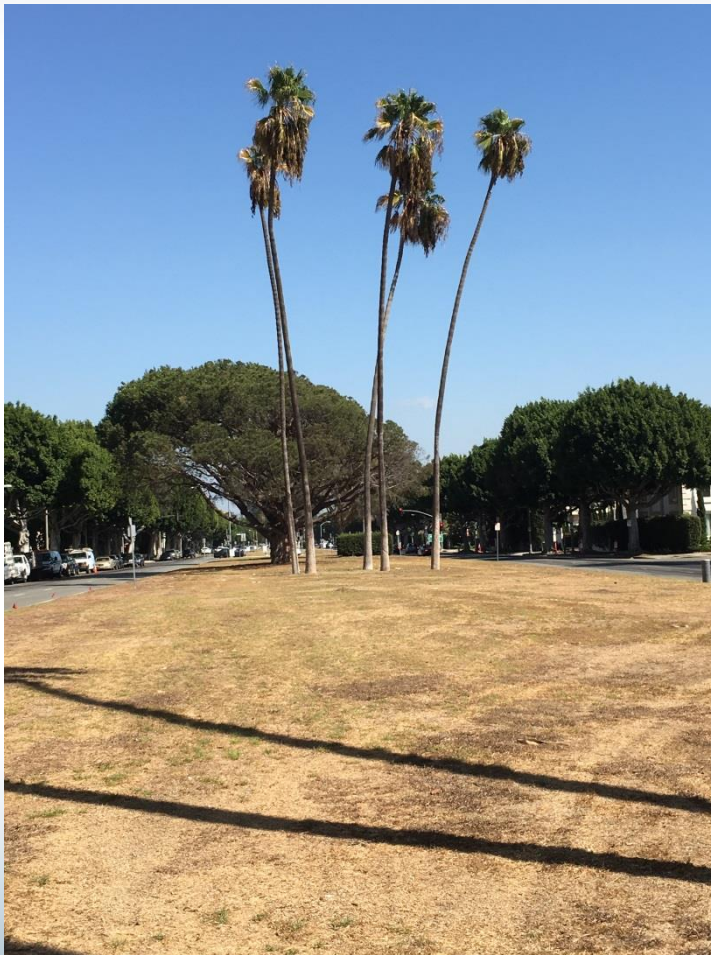
Median on warmer season