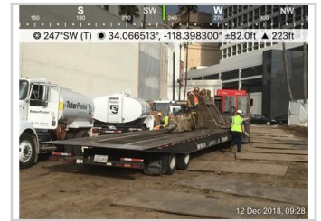
Photo shows crews loading demolition equipment onto a haul truck in the Ace Gallery yard.

UID: 1202 Latitude: 34.0663 Date: Dec 13, 2018 Longitude: -118.39793 Type: Construction Activity Elevation: ---