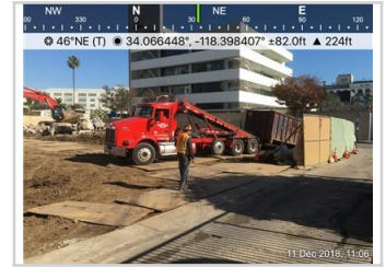
Photo shows a crew preparing to haul a bin off-site.

UID: 1192 Latitude: 34.066917 Date: Dec 11, 2018 Longitude: -118.398224 Type: Construction Activity Elevation: ---