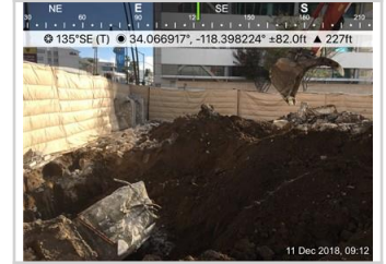
Photo shows Silverado Contractors removing column footings at the northeast corner of the Ace Gallery yard.

UID: 1191 Latitude: 34.066963 Date: Dec 11, 2018 Longitude: -118.398315 Type: Construction Activity Elevation: ---