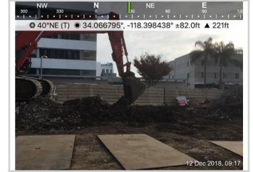
Photo shows Silverado Contractors processing demolition debris in the Ace Gallery yard.

UID: 1200 Latitude: 34.066513 Date: Dec 12, 2018 Longitude: -118.3983 Type: Construction Activity Elevation: ---