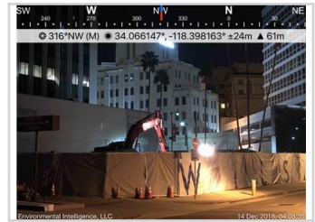
Photo shows Silverado preparing to transport the excavator out of the Ace Gallery yard.

UID: 1204 Latitude: 34.06637 Date: Dec 14, 2018 Longitude: -118.39793 Type: Construction Activity Elevation: - - -