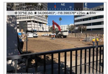
Photo shows Silverado Contractors moving material with the excavator in the Ace Gallery yard.