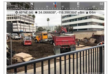
Photo shows a haul truck entering the Ace Gallery yard.

UID: 1195 Latitude: 34.066479 Date: Dec 11, 2018 Longitude: -118.398163 Type: General Elevation: ---