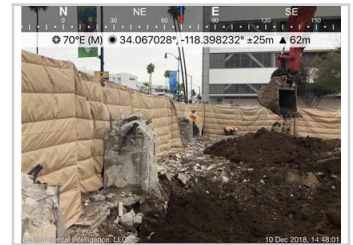
Photo shows the fence at the northeast corner of the Ace Gallery yard after the crew reinstalled the noise blankets. Initially, the noise blankets were draped over the top of the fence, but after ICM Josh Stanford informed Metro Inspector Luis Garcia that failing to enclose noise-producing activity and equipment approaches a violation of Ace Gallery Demolition Permit Conditions 17 and 52, the crew promptly reinstalled the noise blankets on the fence. A violation was not issued.

UID: 2444 Latitude: 34.06696 Date: Dec 10, 2018 Longitude: -118.3979 Type: General Elevation: ---