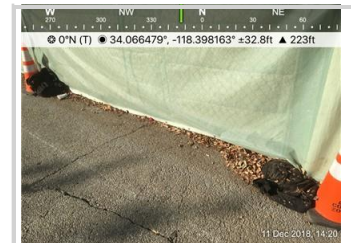
Photo shows leaves and soil that accumulated along the Ace Gallery yard fencing.