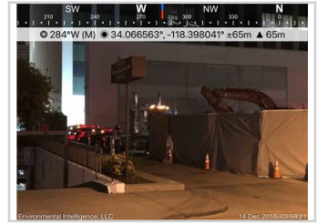
Photo shows a truck arriving to transport the excavator out of the Ace Gallery yard.

UID: 1207 Latitude: 34.0664 Date: Dec 14, 2018 Longitude: -118.3982 Type: Construction Activity Elevation: - - -