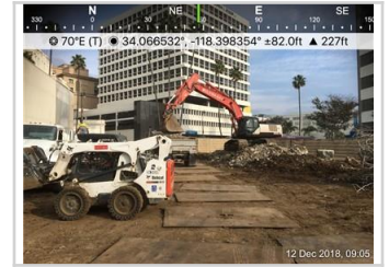
Photo shows Silverado loading demolition debris into a haul truck in the Ace Gallery yard.

UID: 1199 Latitude: 34.066795 Date: Dec 12, 2018 Longitude: -118.3984 Type: Construction Activity Elevation: ---