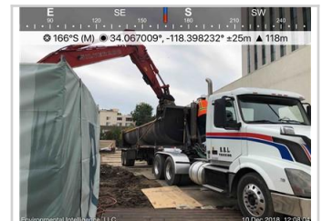
Photo shows Silverado Contractors loading demolition debris into a haul truck in the Ace Gallery yard.

UID: 2443 Latitude: 34.06645 Date: Dec 10, 2018 Longitude: -118.39846 Type: Construction Activity Elevation: ---