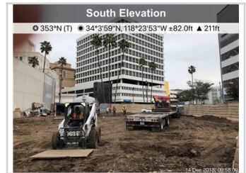
Photo shows crews loading metal plates onto a haul truck in the Ace Gallery yard.