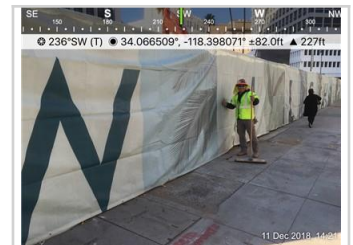
Photo shows TPOG sweeping and cleaning the sidewalks on the west side of S. Reeves Dr. between Wilshire Blvd. and the alley south of the Ace Gallery.

UID: 1193 Latitude: 34.066456 Date: Dec 11, 2018 Longitude: -118.397977 Type: Construction Activity Elevation: ---