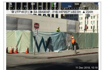
Photo shows TPOG placing aesthetic coverings on the western fence of the Ace Gallery yard.