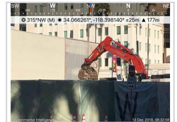
Photo shows Silverado Contractors loading demolition debris into a dump truck in the Ace Gallery yard.

UID: 1203 Latitude: 34.0665 Date: Dec 13, 2018 Longitude: -118.39805 Type: Construction Activity Elevation: ---