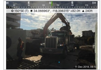
Photo shows the haul truck that did not initially have a "low impact backup alarm". This activity approached a violation, as Ace Gallery Demolition Permit Condition 17 and Metro 5-Step Noise Control Plan Part 3.1 state that all equipment on-site shall utilize "low impact backup alarms". The ICM notified Metro Inspector Luis Garcia of the issue, and the issue was immediately rectified. A violation was not issued.

UID: 1197 Latitude: 34.066826 Date: Dec 11, 2018 Longitude: -118.398308 Type: Construction Activity Elevation: ---