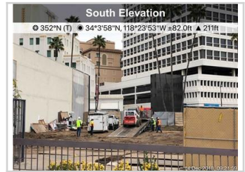
Photo shows crews preparing to haul metal plates and the water truck off-site.

UID: 1206 Latitude: 34.06655 Date: Dec 14, 2018 Longitude: -118.39825 Type: Construction Activity Elevation: - - -