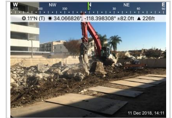
Photo shows Silverado Contractors breaking down and processing demolition debris in the Ace Gallery yard.

UID: 1196 Latitude: 34.066509 Date: Dec 11, 2018 Longitude: -118.398071 Type: Construction Activity Elevation: ---