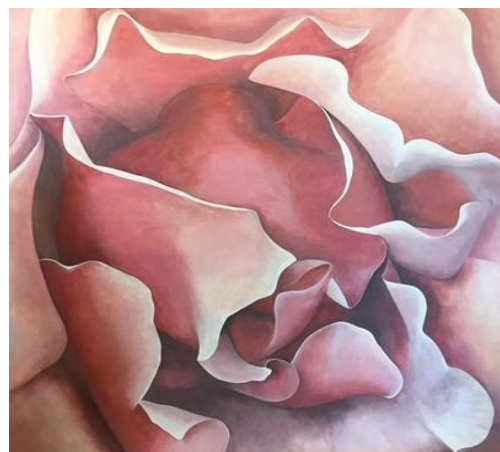
Steven Bryer is inspired by the forms, colors and details discovered in nature. Space 413 , throughout both days