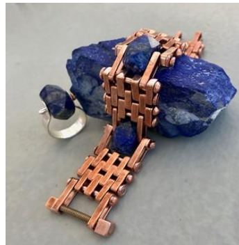
Deidre Greene takes industrial raw material metals and transforms them into fine art jewelry with vintage tools. Space 358 , throughout both days