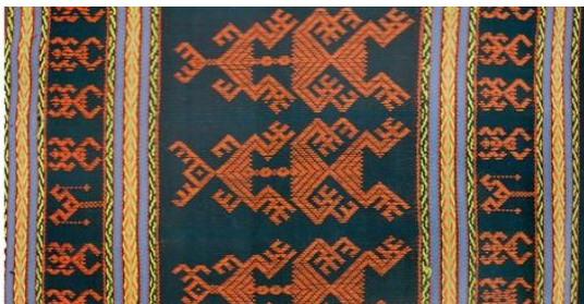
Yan Zhang is one of the 200 people or so around the world who can skillfully use Li Textile technique, a unique skill that is on the brink of extinction. Space 324 , Sat & Sun, at 11-12am & 2-3pm