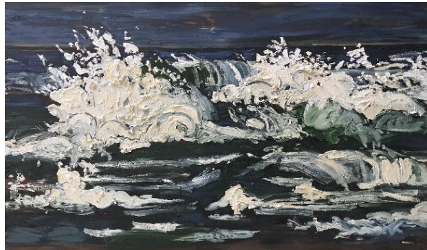
Lisa Baldwin paints from life whenever possible, leaving in only what's vital, creating "visual haikus". Space 223 , Sat & Sun at 11am