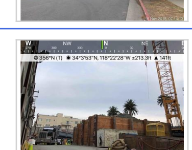
Photo shows STS preparing to adjust the length of a parking space on the north side of Wilshire Blvd. between Stanley Dr. and Carson Dr.