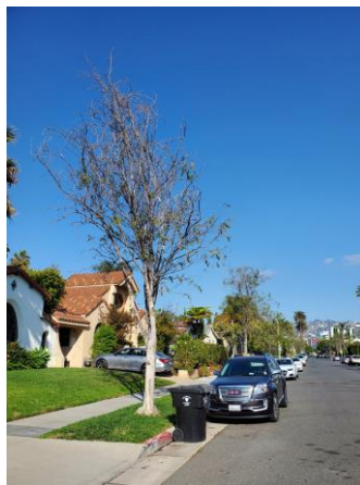
Robinia Tree (will be removed)