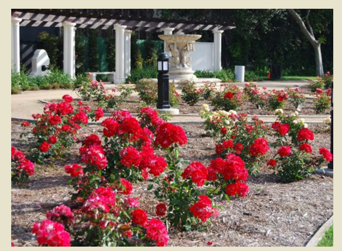
Beverly Gardens Rose Garden renovation

Enhance our parks, athletic fields and indoor facilities by contributing towards amenities that are sometimes taken for granted. Benches, tables, audio-visual equipment, and sports and field equipment are some ideas of how your donation could be used. You can also help maintain Beverly Hills' image as the "Garden City" through contributions towards picturesque planters filled with beautiful flowers and shrubbery, by renovating or purchasing a rose garden, or by renovating a fountain.