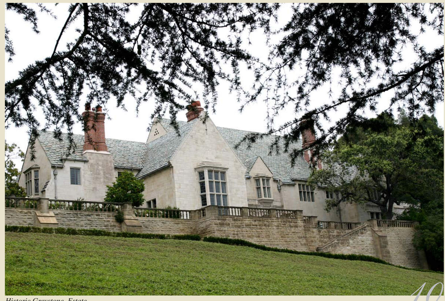
Historic Greystone Estate