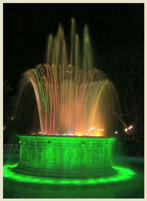
Electric Fountain at Wilshire/Santa Monica Blvds.

This large scale park project requires active community involvement and support at every level to generate the needed funding. Opportunities abound for residents to have a real impact in shaping their hometown's future. For more information on how to become involved, please call 310.551.5458, or check the Friends of Beverly Gardens Park website at <a href="https://www.FOBGP.org">www.FOBGP.org</a>.