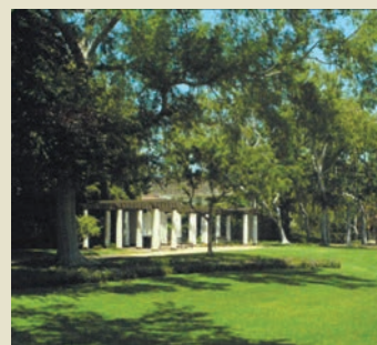
Beverly Gardens Pergola