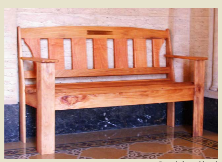
Recycled wood bench donated by the Rotary Club of Beverly Hills