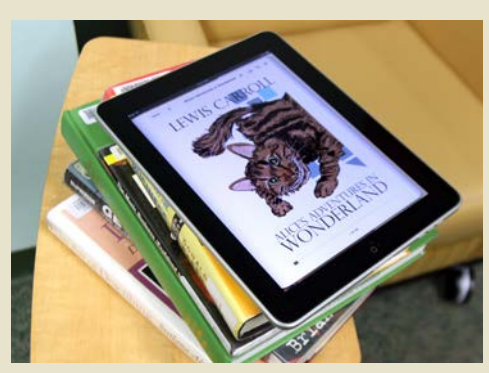
"E-book" Donation from the Rotary Club of Beverly Hills