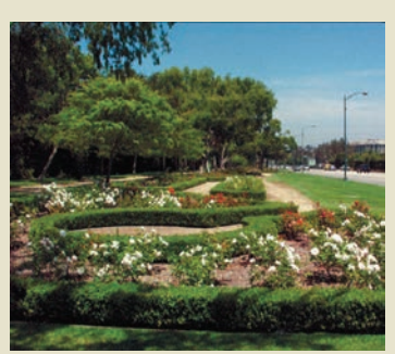
Beverly Gardens Rose Garden