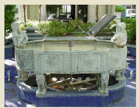
The Knoll Fountain, an anomymous donation to Greystone Park

For Friends of Greystone information, please call 310.286.0119 or check their website at www.greystonemansion.org.