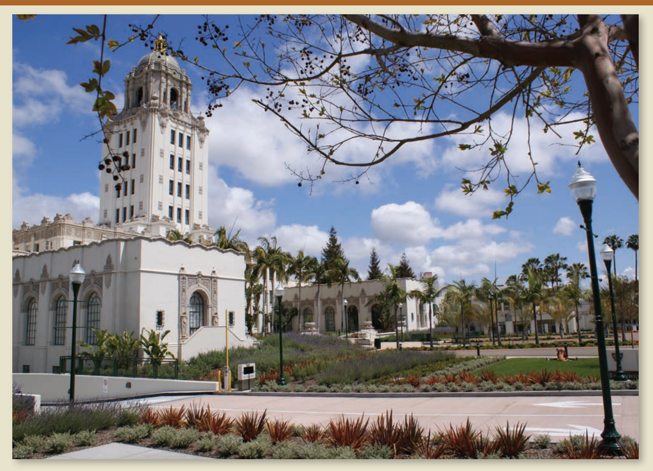
The City of Beverly Hills Community Charitable Foundation, Friends of the Beverly Hills Public Library and Friends of Greystone are non-profit organizations tax exempt under Section 501(c)(3). Contributions are tax deductible.