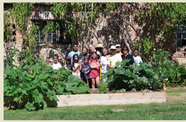
The Greystone Demonstration Garden is a true community project

Help teach Beverly Hills residents and visitors how to live sustainably by donating to the Greystone Demonstration Garden, nestled on the lawn adjacent to the historic greenhouse. Adopt a bench, bed of vegetables, honeybee garden or educational signage. An additional unique opportunity exists to help restore the Greystone greenhouse to its former splendor and make it a viable education center.