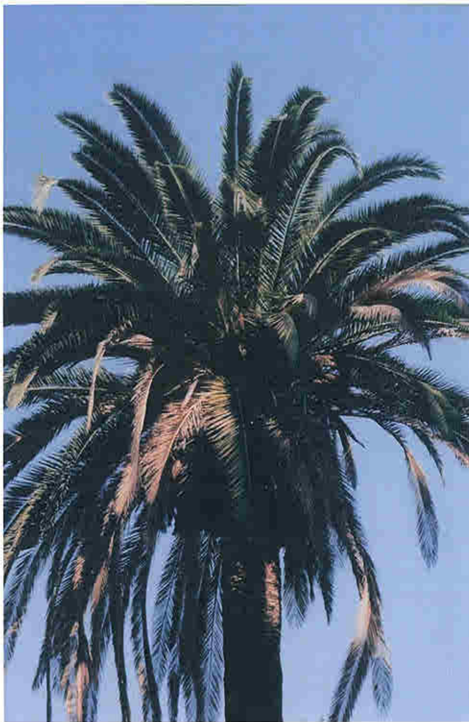
2. Phoenix canariensis displaying Class I Fusarium oxysporum symptomology.

infections and in the catastrophic structural failure of the stem (i.e. "Sudden Crown Drop") in P. canariensis . Provide stability in the manner you irrigate your palms. Avoid fluctuation and excess. Palms require consistency.