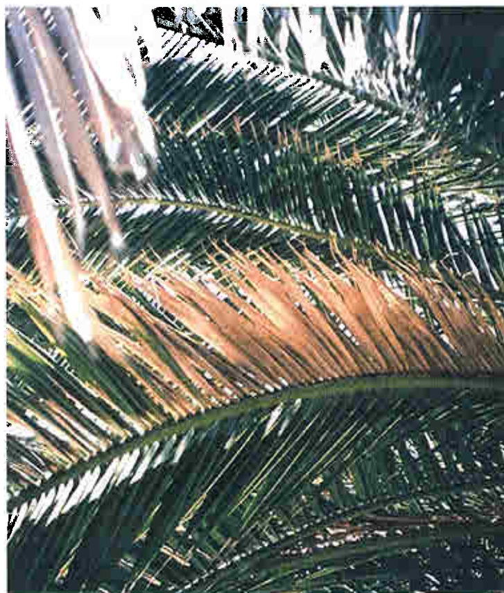
1. One-sided die back of a frond of Phoenix canariensis infected with Fusarium oxysporum .

Ken Pfalzgraf 34520 Red Rover Mine Road Acton, CA 93510 Palmdr@sbcglobal.net