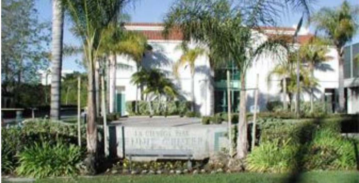
La Cienega Tennis Center