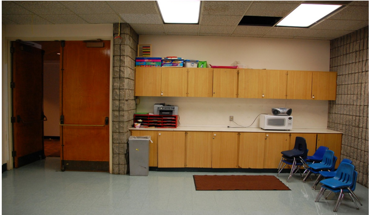
Community Center Meeting Room