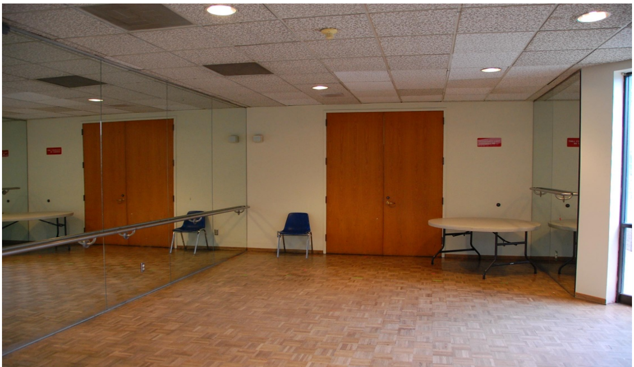
Community Center Dance Studio