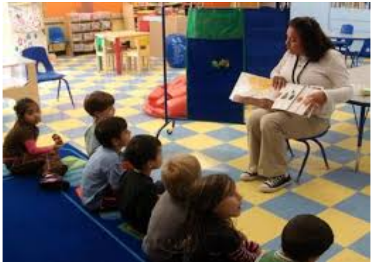
La Cienega Preschool

A stated priority of the Beverly Hills City Council is to develop a master plan for La Cienega Park which coordinates an underground regional water retention structure, parking and community center and park needs. The scope of this RFP process is to carry out a public engagement process to determine community center needs for the buildings and site.