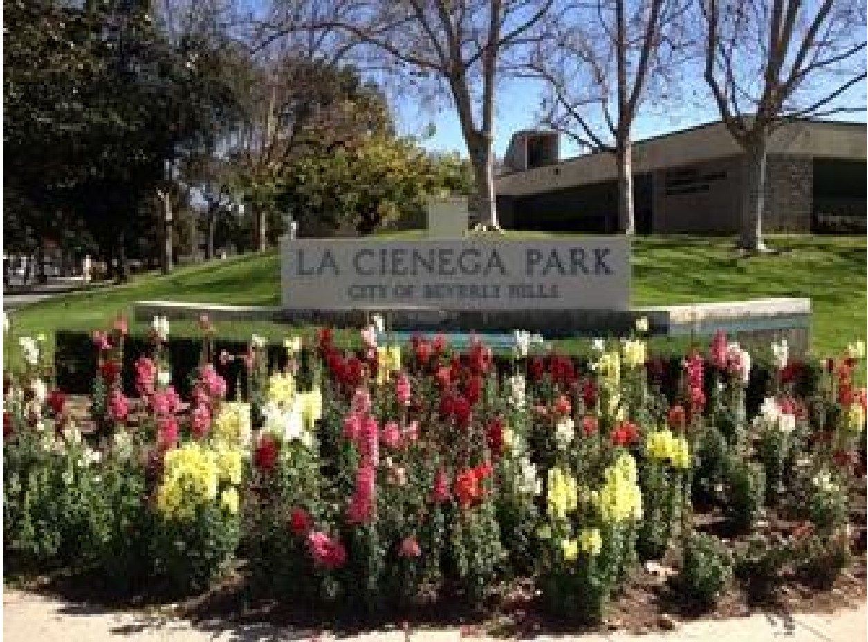
La Cienega Community Center