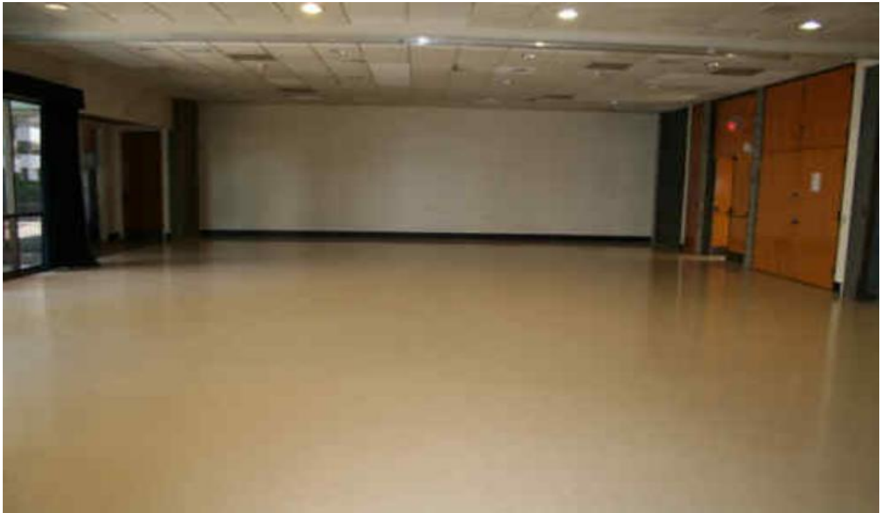
Community Center Multipurpose Room