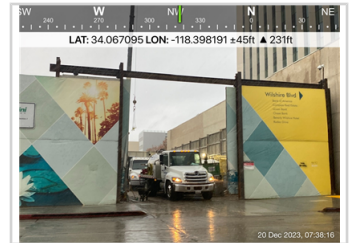
Photo shows United Rentals servicing restrooms at Reeves Yard.

UID: 15157 Latitude: 34.067195 Date: Dec 20, 2023 Longitude: -118.396993 Type: Construction Activity Elevation: ---