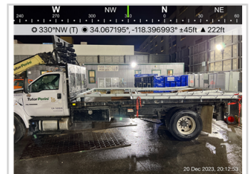
Photo shows construction materials loaded onto TPOG haul truck in Canon yard.

UID: 15156 Latitude: 34.067219 Date: Dec 20, 2023 Longitude: -118.397166 Type: Construction Activity Elevation: ---