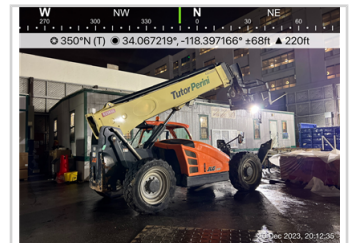
Photo shows TPOG staging telehandler in Canon yard.