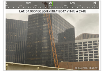
Photo shows TPOG crane within Constellation Yard.

UID: 15144 Latitude: 34.066986 Date: Dec 20, 2023 Longitude: -118.398374 Type: Construction Activity Elevation: ---