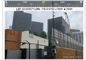
Photo shows Constellation Yard.

UID: 15148 Latitude: 34.060486 Date: Dec 20, 2023 Longitude: -118.412047 Type: Construction Activity Elevation: ---