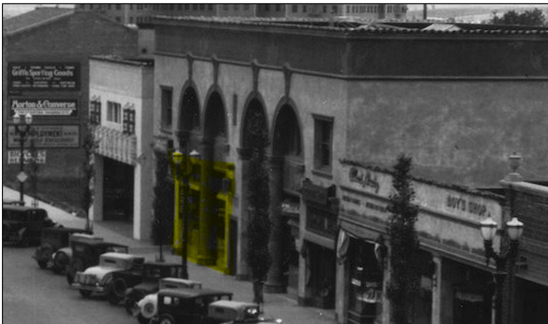
Pioneer Hardware (highlighted yellow), original location at 439 North Beverly Drive, 1930