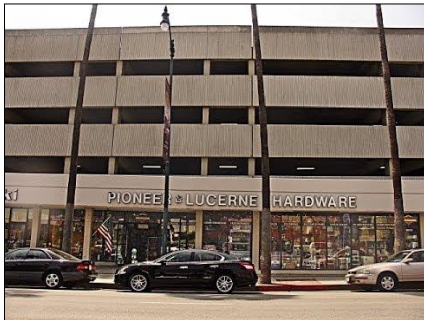
Pioneer-Lucerne Hardware, current location, 315 North Crescent Drive