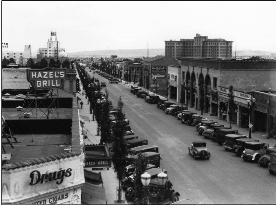
North Beverly Drive looking south, 1930 (Pioneer Hardware right center)