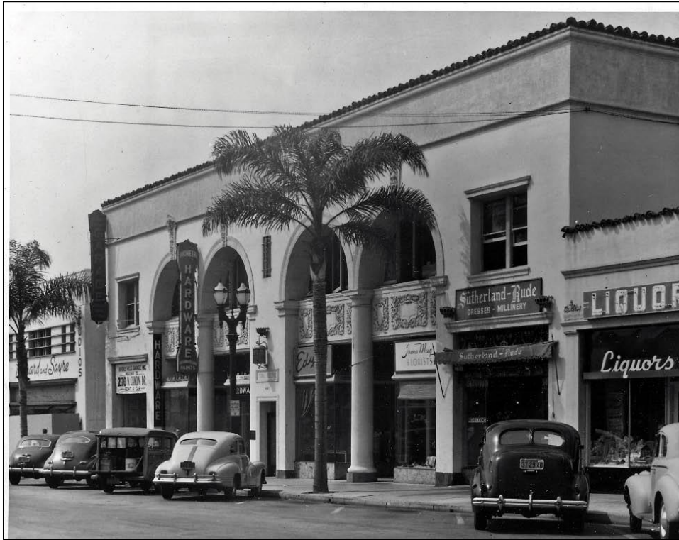
Pioneer Hardware, original location at 439 North Beverly Drive, early 1940s