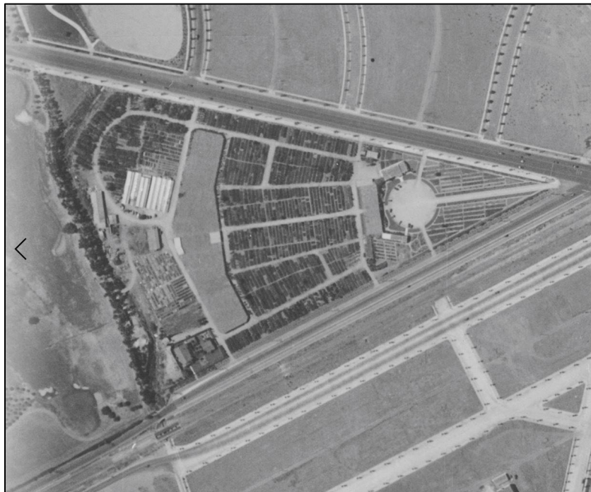
Beverly Hills Nurseries (relocated site), at Wilshire and Santa Monica boulevards (1928) Note long driveway entrance at the “point” and circle paved parking area.