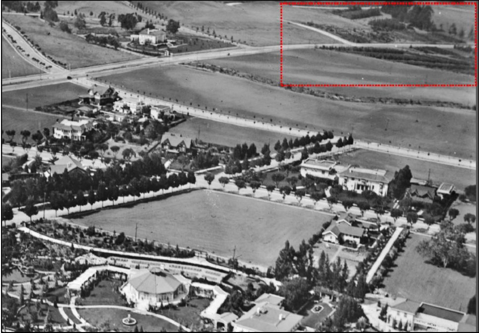
Beverly Hills Nurseries, upper right corner of photo (1918)