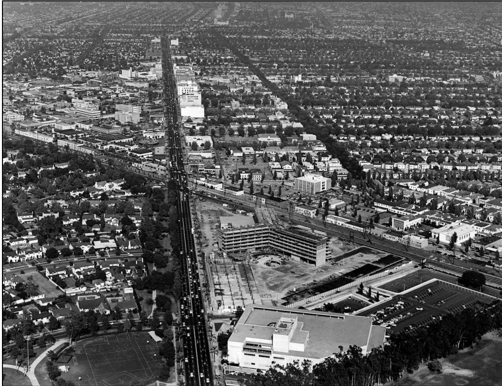
Beverly Hilton Hotel (under construction), center bottom at cross-roads of photo (1954)

The prior nursery site development with a gas station, park, and the Robinson's Department store (bottom left), 1953