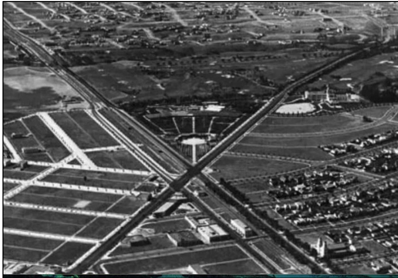
Beverly Hills Nurseries (relocated site), center at cross-roads of photo (1928)