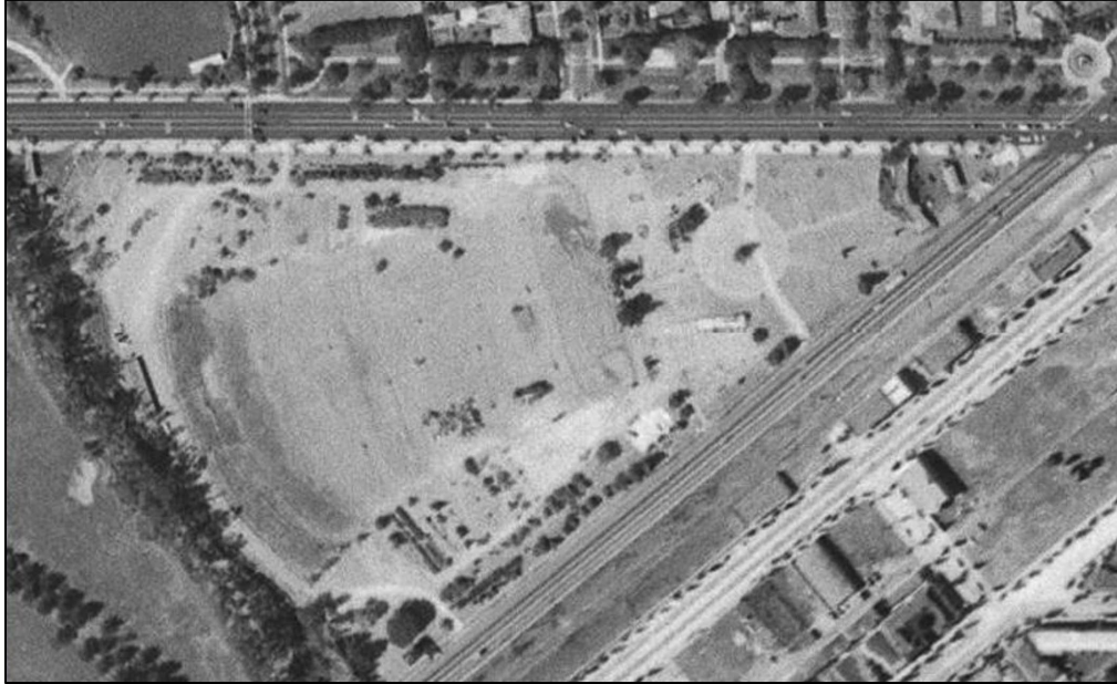
Aerial photo of the “point” developed with a gas station and small park, 1947