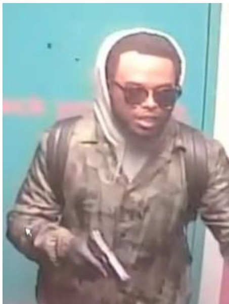
Suspect in the March 26 robbery of Bloom dispensary in Phoenix.

One reason Arizona dispensaries have not been magnets for crime since the first one opened in December 2012 is that they already take robust security measures, including heavy use of video cameras.