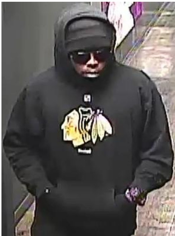
Second of three suspects in the Bloom dispensary robbery of March 26.

Banks worry about running afoul of federal law and generally refuse to do business with dispensaries. The problem has led to a system in which many dispensaries collect cash from patients instead of using debit or credit cards. The dispensaries then deposit the cash in accounts bearing the names of non-marijuana businesses – it's a type of money laundering that has received tentative approval from federal officials.