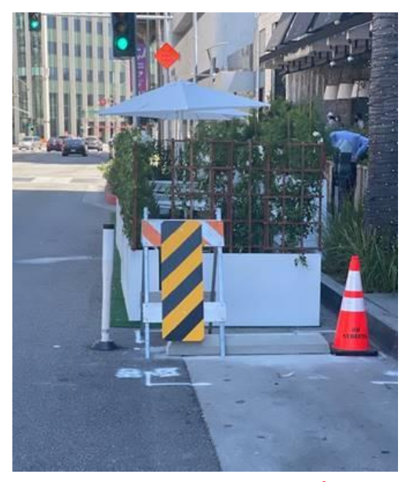
To apply, visit: BeverlyHills.org/OpenBH

The City has committed to providing the necessary traffic safety measures shown above & below: wheel stop, signage, etc.