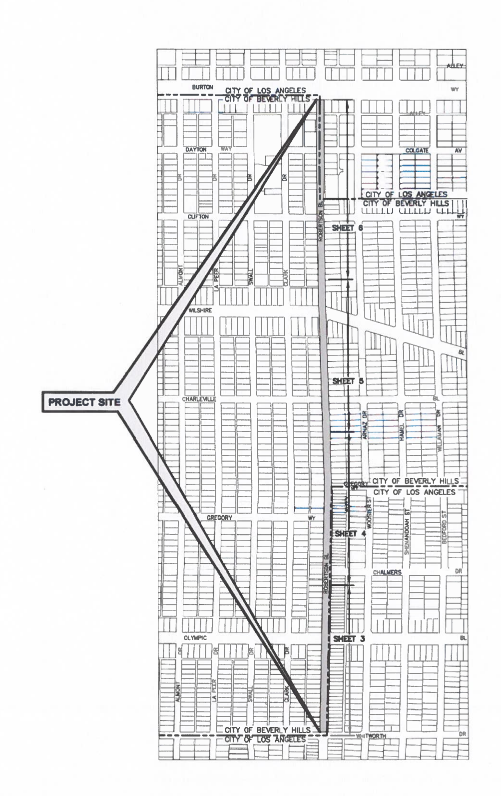
FIGURE 2: Project Site Robertson Boulevard Sidewalk Improvement Project City of Beverly Hills